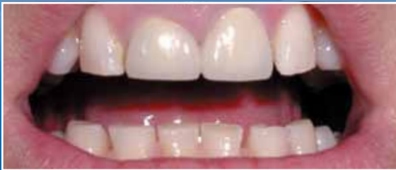
Bruxing can wear down and destroy your teeth.

Do you wake up with a stiff, tired jaw? Are your teeth sensitive to cold drinks? If you answered yes to either of these questions, you may be grinding or clenching your teeth during sleep. Grinding of the teeth is a medical condition called bruxism. Over time, bruxism will result in the wearing down of your natural tooth enamel. In fact, studies suggest that those who grind and clench their teeth experience up to 80 times the normal wear per day compared with those who do not.